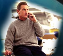
IT / Project Manager